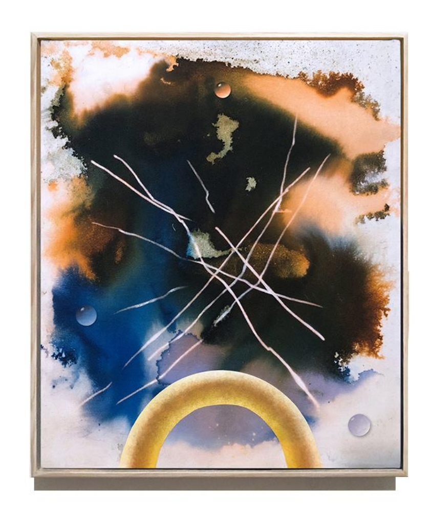
Gail Stoicheff Icon 3 Sisters , 2020 oil and dye on canvas, 51 x 43 cm (20 x 17 in)