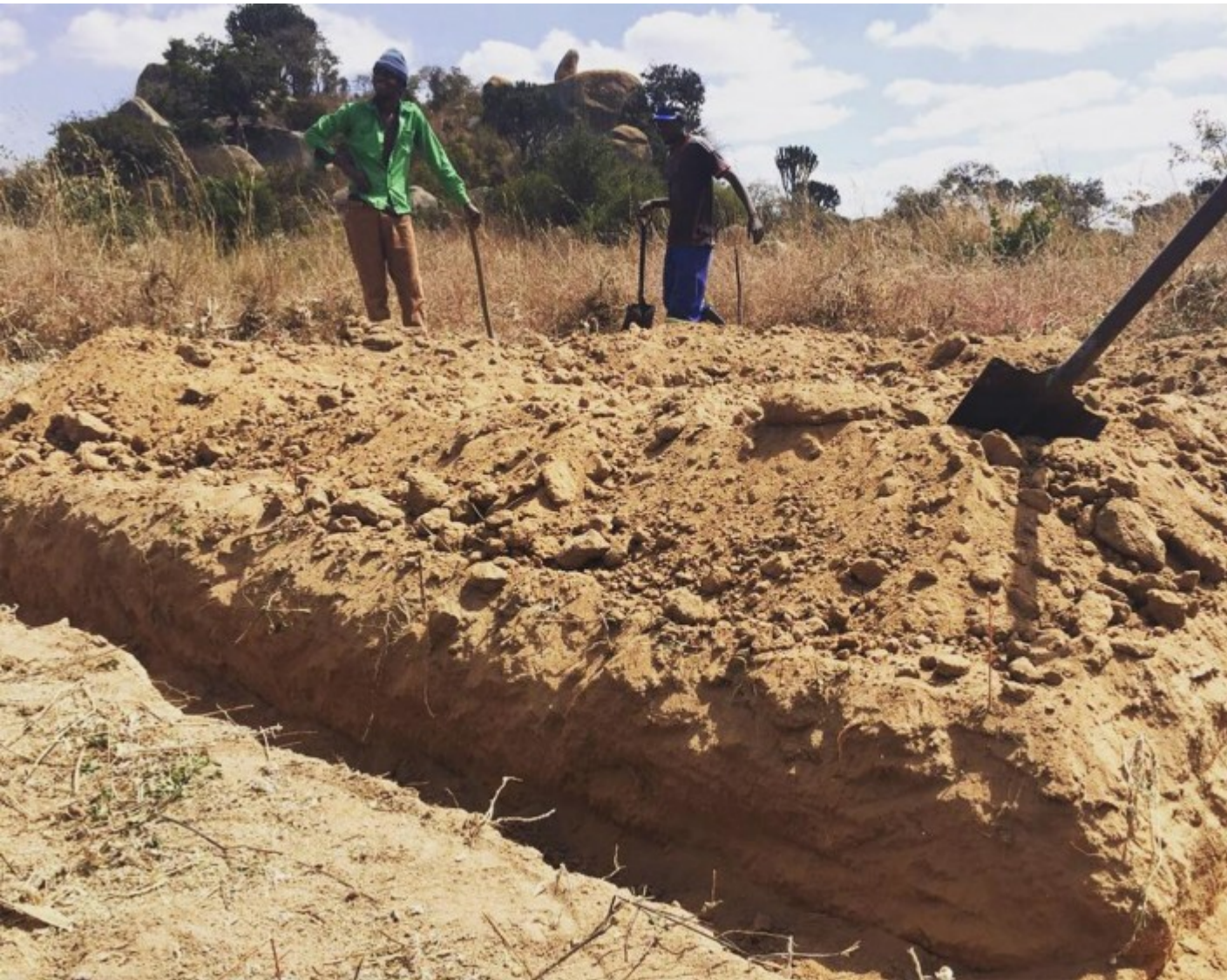
Day 3: Breaking Ground