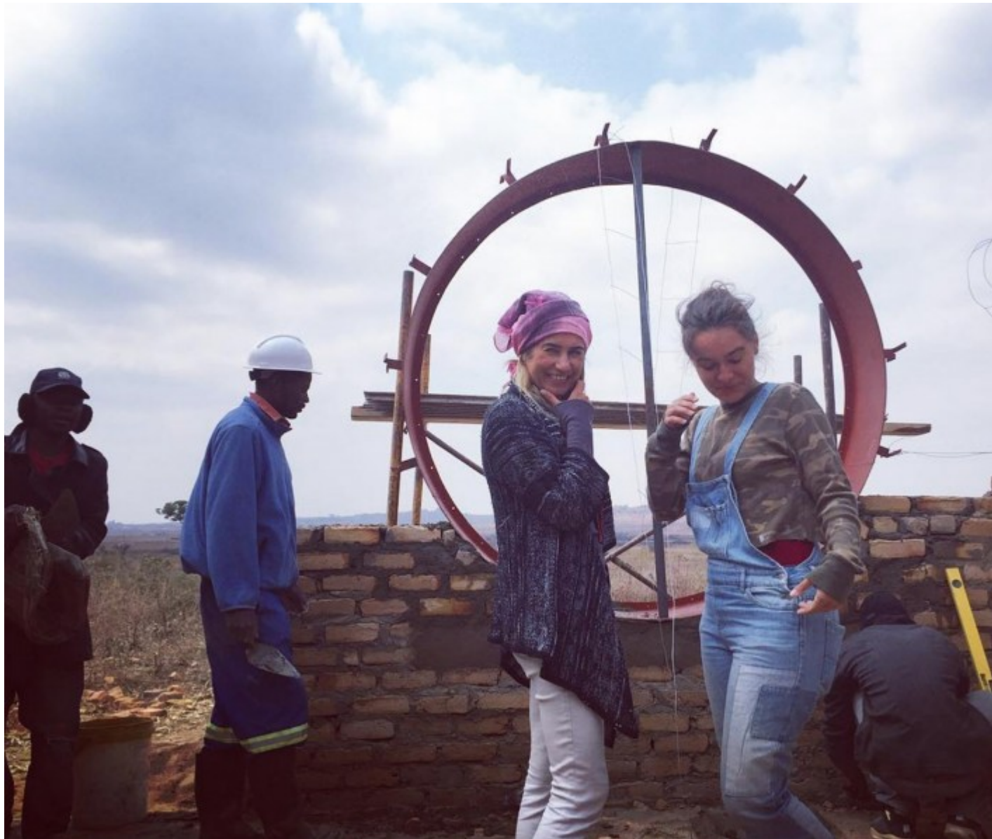
DAY 10: Our window arrived!