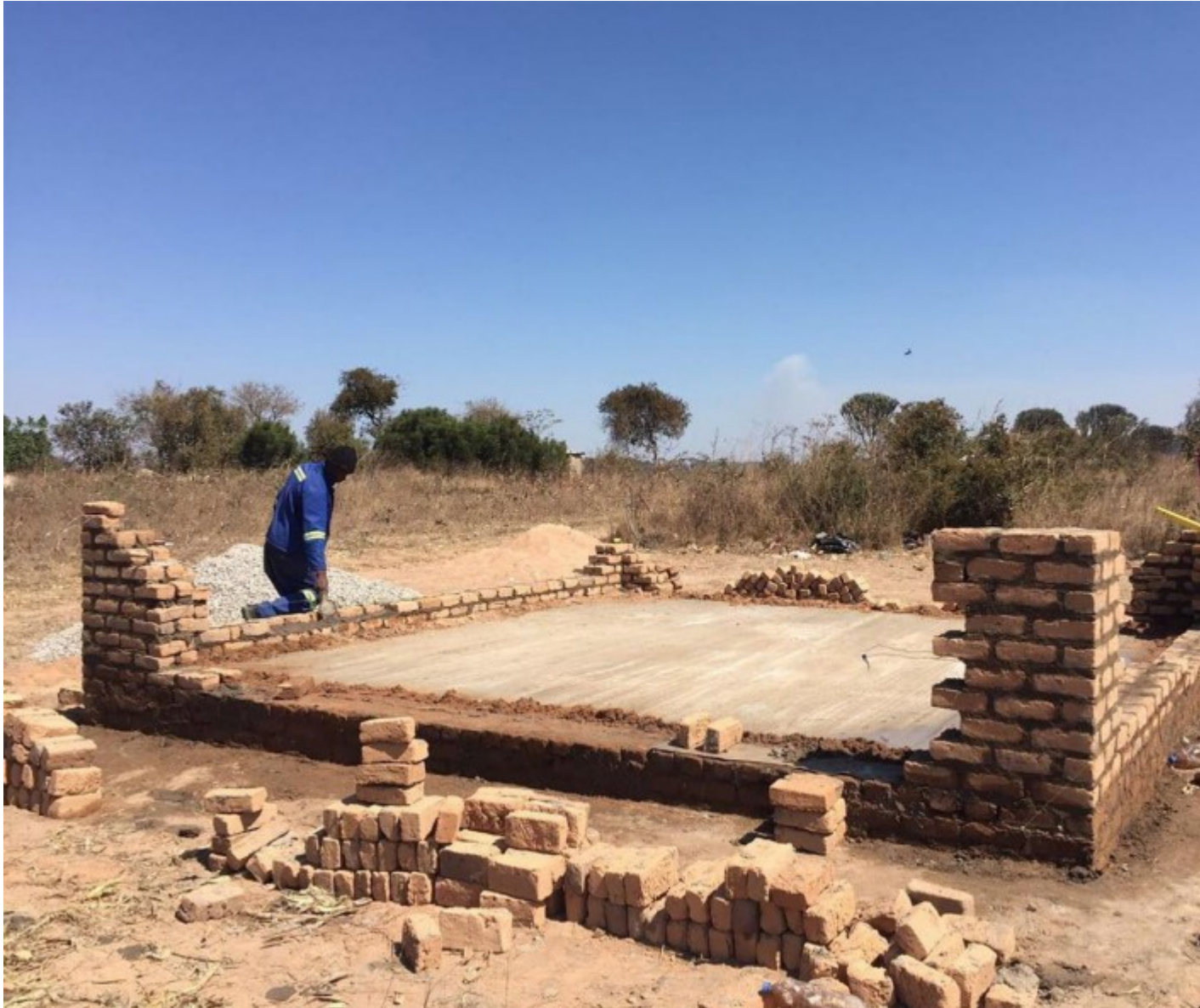
DAY 7: We have a floor!