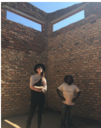
DAY 14: our North and West walls windows are in!