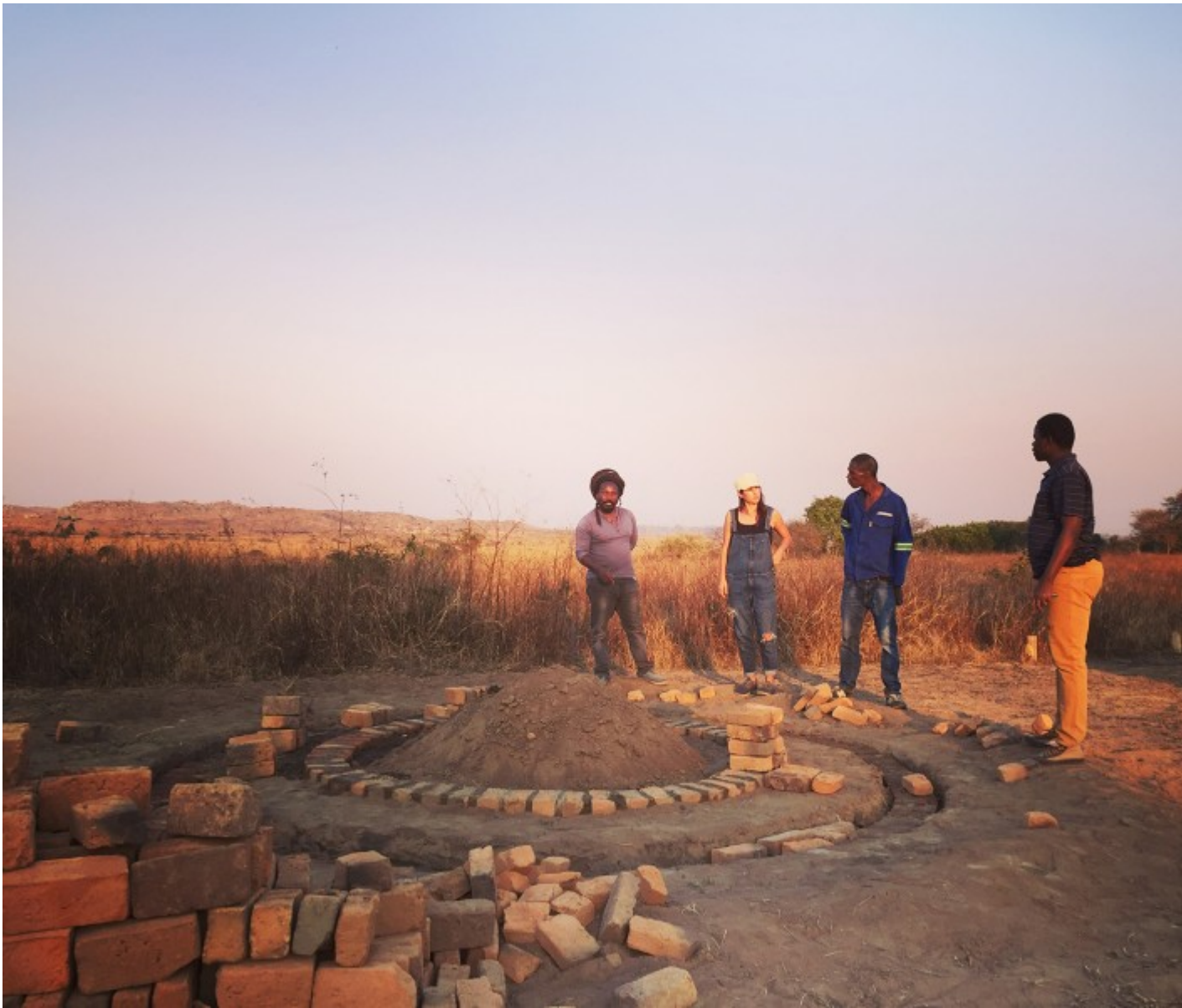
Day 3 of 2018: Bricks have arrived for laying!