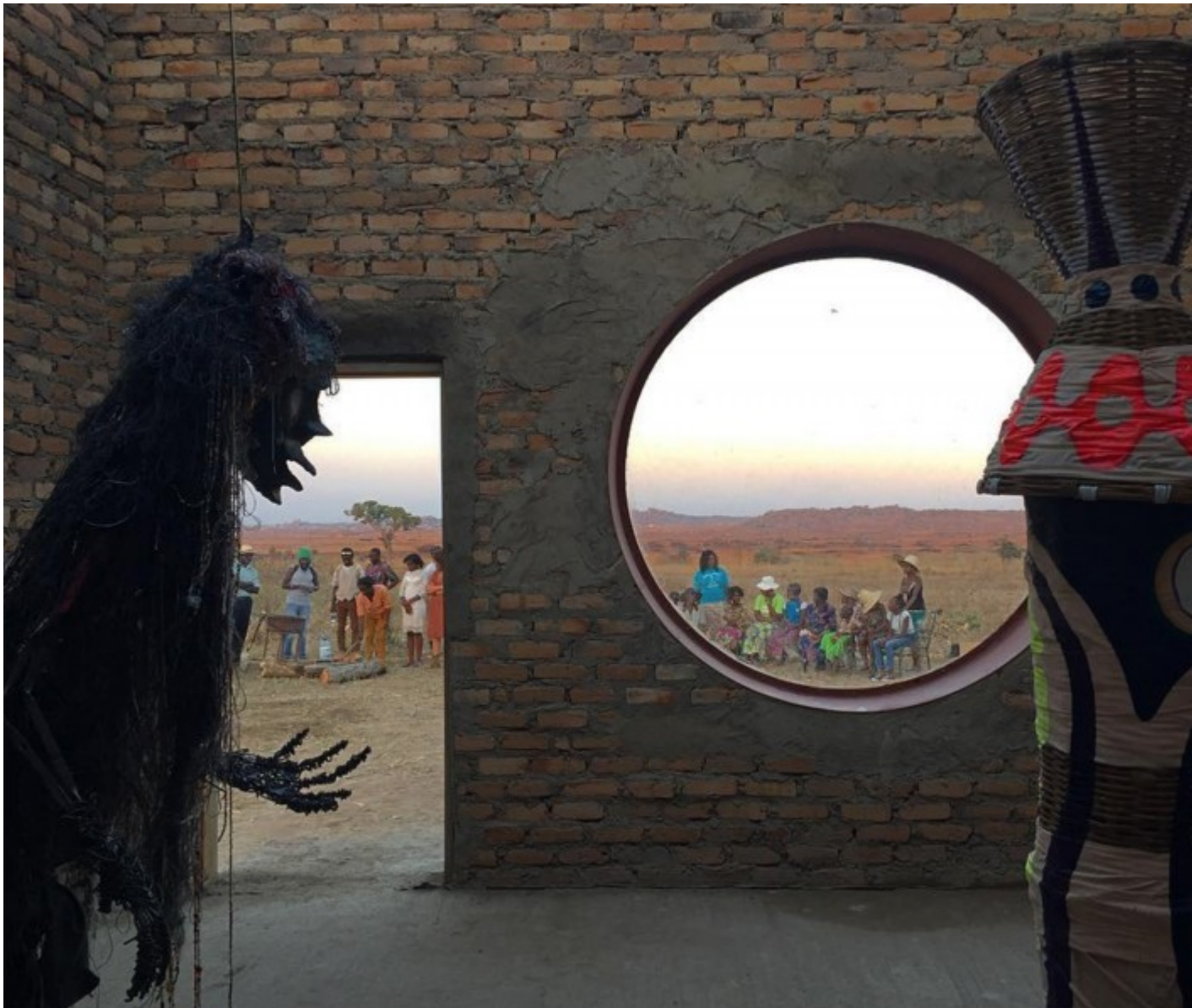
DAY 15: Opening of our first exhibition in our new gallery.