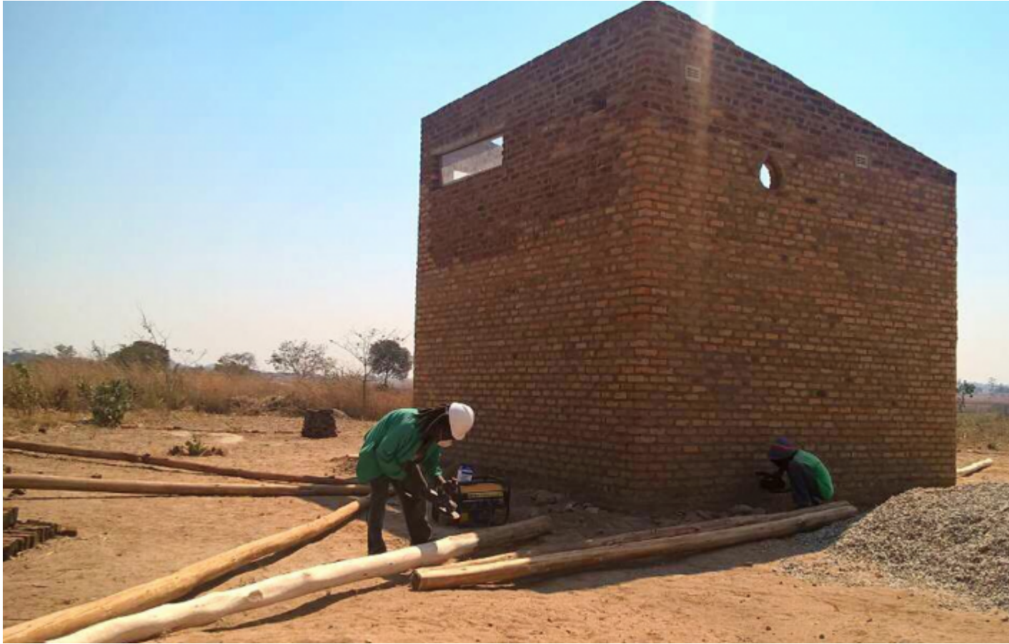
DAY 18: six meter trunks are brought in as work begins on our roof!