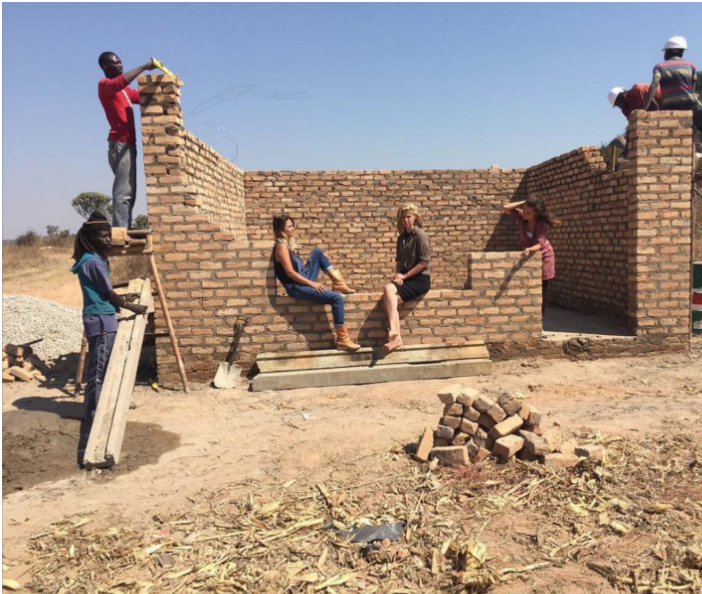
DAY 9: Bricks bricks bricks – we hit 2.3 meters.