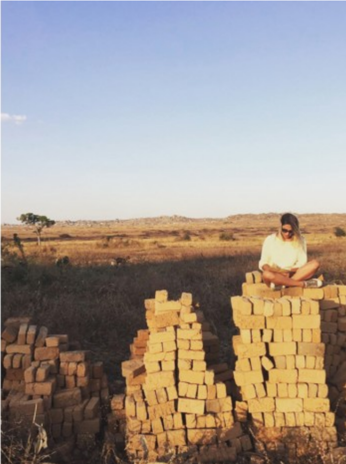
Day 4: Materials, and contemplation.