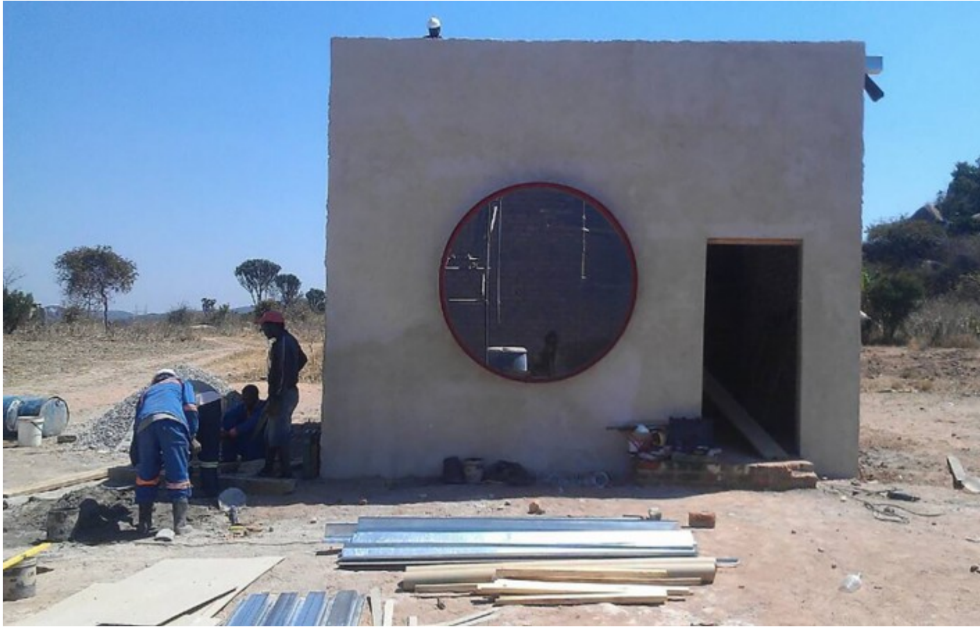
Day 20: The face of the gallery fully plastered.