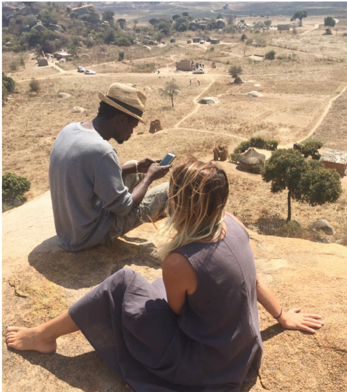
DAY 11: Bird's eye view of the gallery