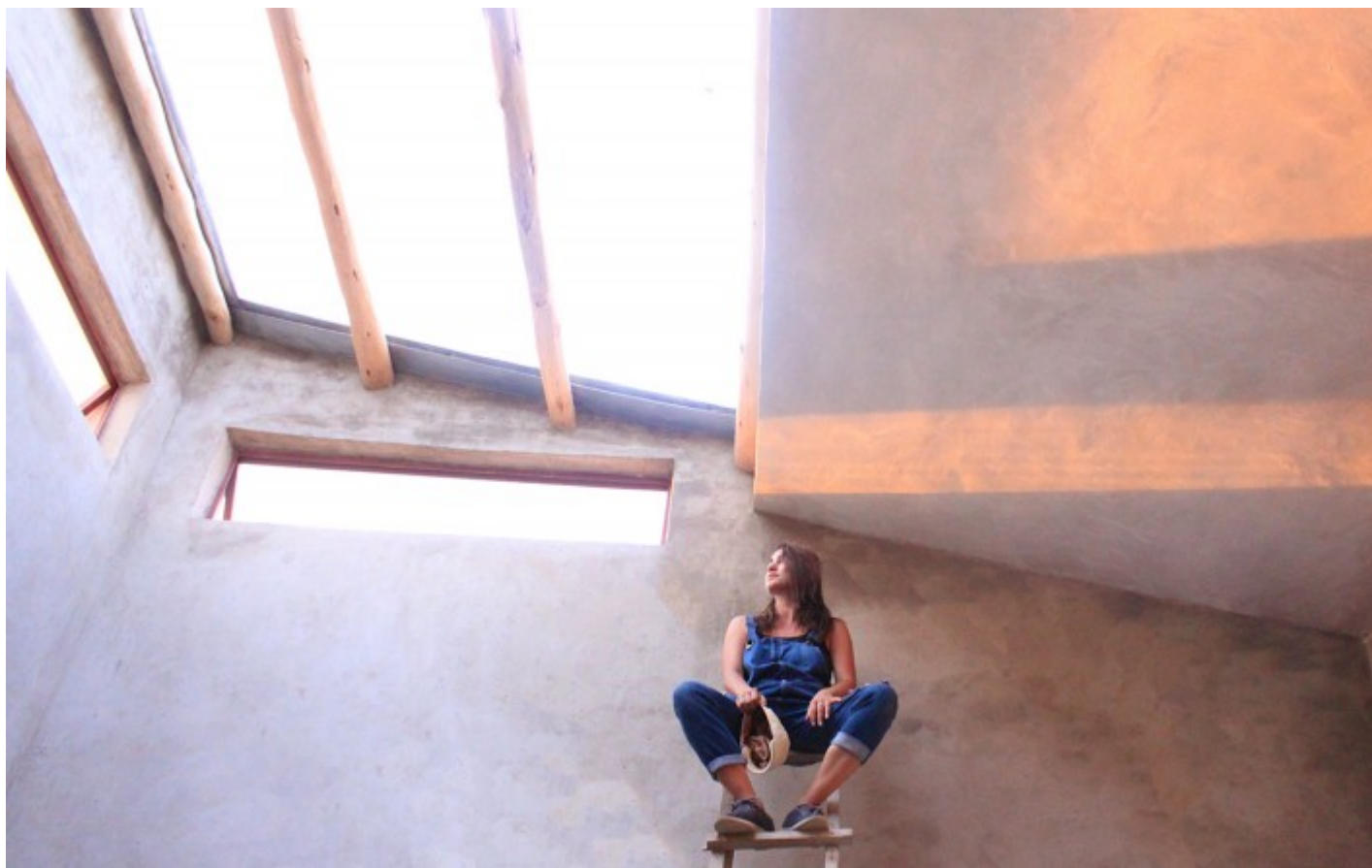
Day 45: Roof finished.