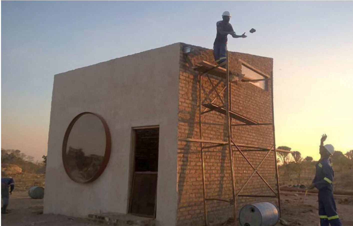
DAY 21: This gallery just keeps getting taller!