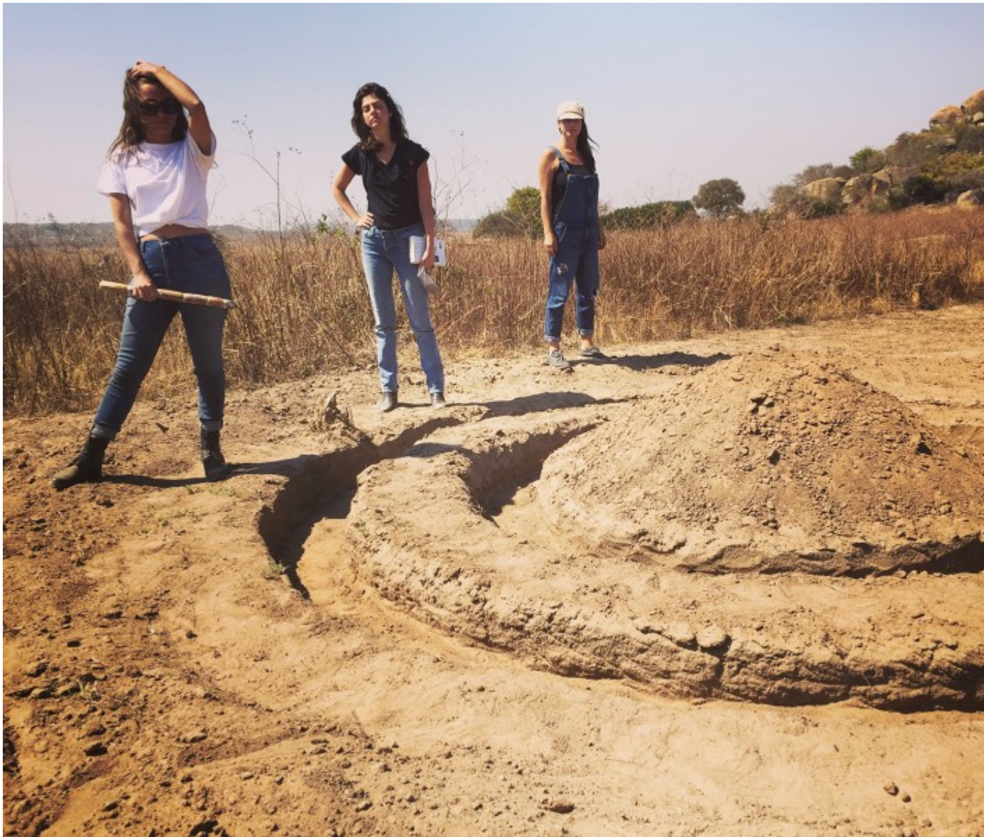
Day 1 of 2018: Digging the foundation for our community seating.