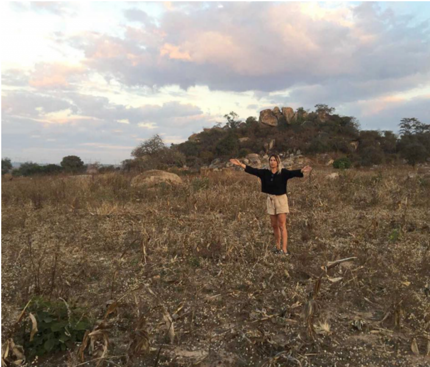
DAY 1: selecting exact placement and orientation of CTG Harare: facing East, looking out onto a far off horizon