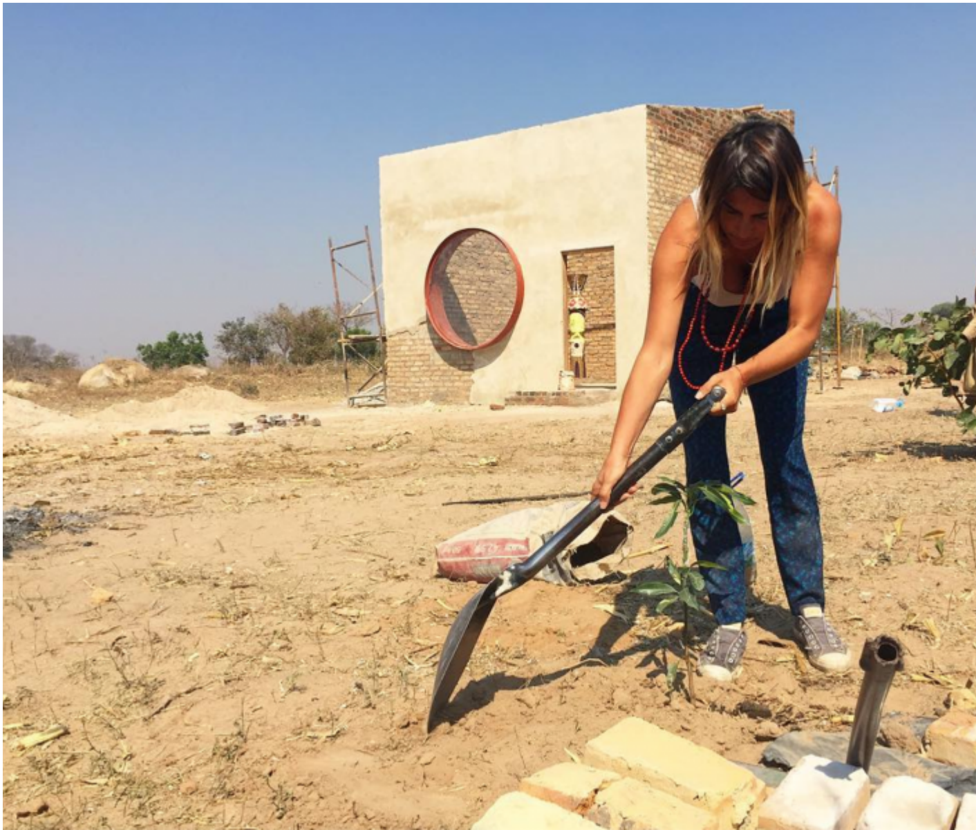
DAY 16: Planting a mango tree: a promise to the earth.