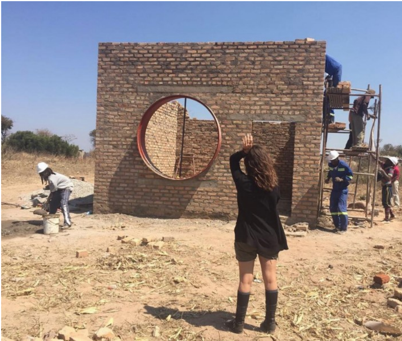
DAY 12: We hit 4 meters on the front wall.