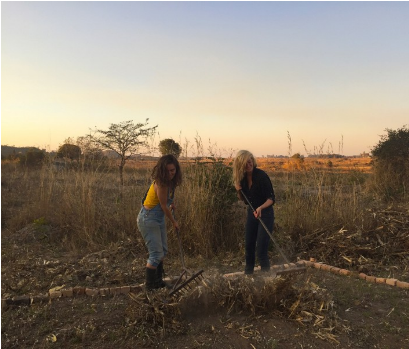
Day 13: Clearing the land.