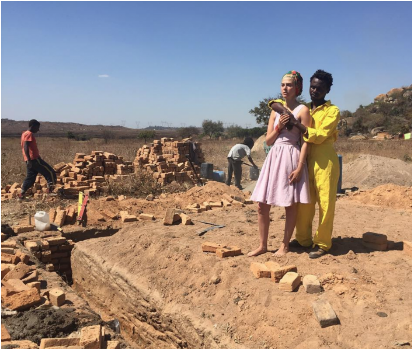
DAY 5: laying bricks and making art

DAY 6: compacting the foundation is hard work! from Catinca Tabacaru Gallery on Vimeo .