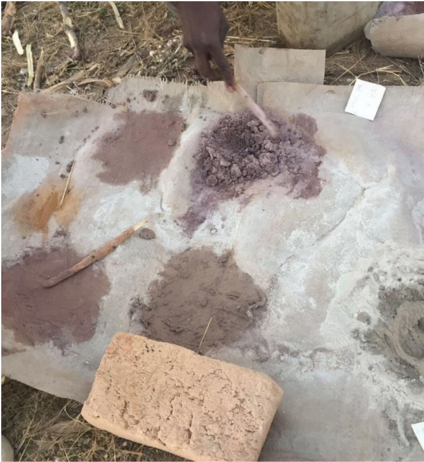
DAY 8: color testing – carefully considering the aesthetics of the gallery within the context of the bush.