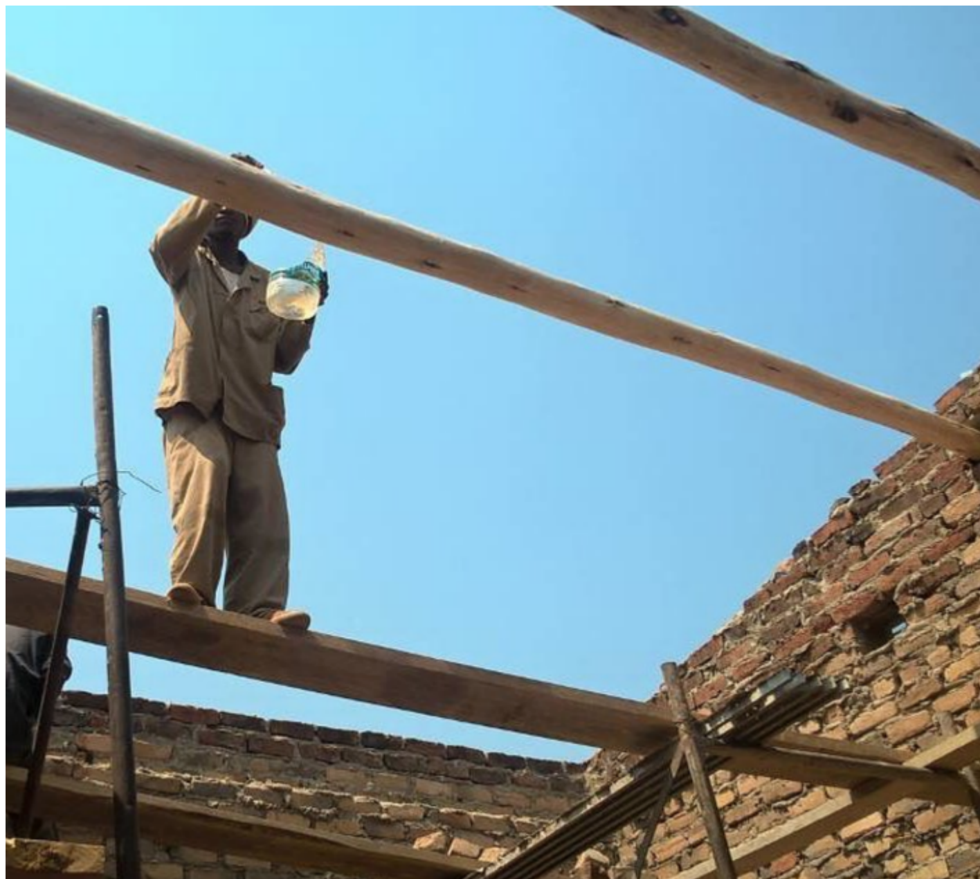
DAY 19: sealing the wood to keep out the pests.